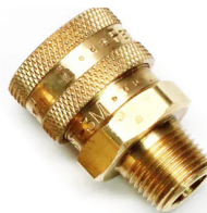
Quick release female coupling