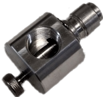
Twist-Loc single manifold